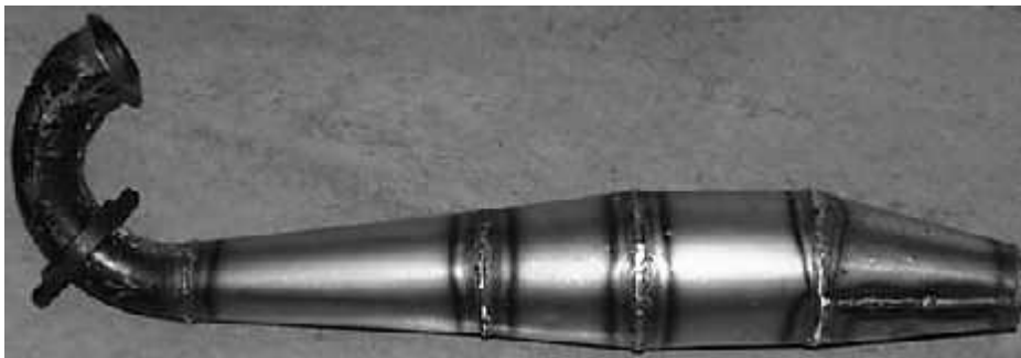
XP-exhaust system with the short asymmetrical reverse cone

This reverse cone should allow the system to be fitted without risk of interference with the wheelhouse and the straight sidewall makes it easier to fit the adapter for your 2" pipe.